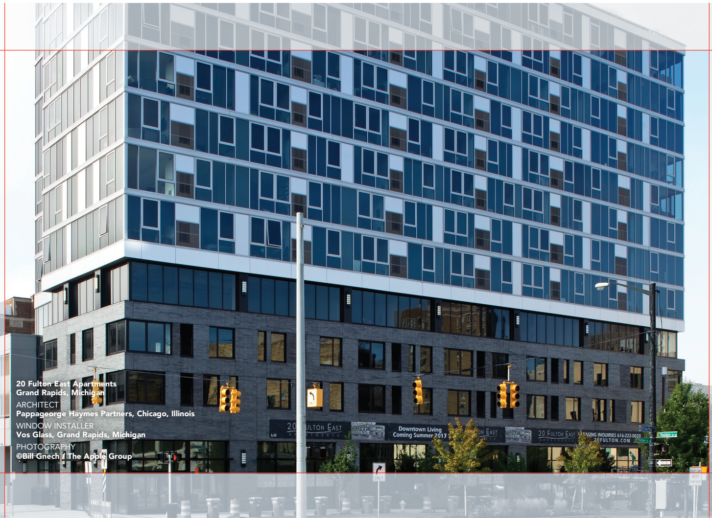
20 Fulton East Apartments Grand Rapids, Michigan ARCHITECT Pappageorge Haymes Partners, Chicago, Illinois WINDOW INSTALLER Vos Glass, Grand Rapids, Michigan

Sleek, efficient and versatile. FG 501T Window Wall – the first in the MetroView® Window Wall series – packs the desired aesthetics of a curtain wall into a cost-efficient window wall system. Ideal for mid-rise commercial projects and sophisticated multifamily housing, MetroView® FG 501T Window Wall delivers the refined design features that are so popular in today's urban and near-urban cityscapes.